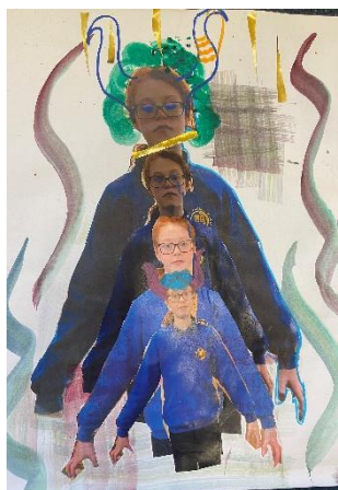
Year 6 children have been transforming themselves into Greek gods and goddesses...