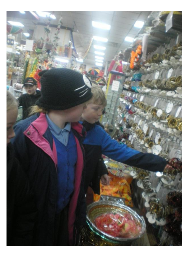
World Book Day - March 7th