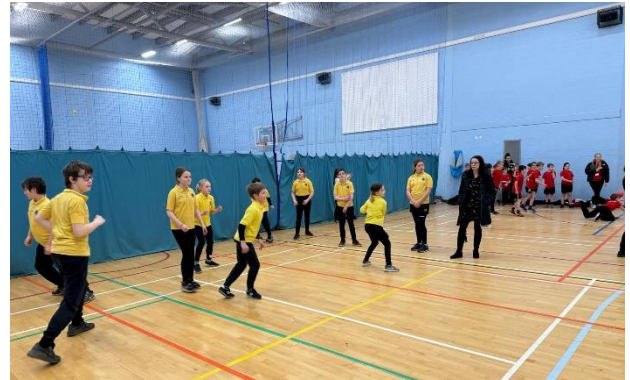
Dodgeball with years 5 and 6.

We have had a very busy few weeks with lots of visits and visitors into school. Here are just some of the great experiences your children have been having. We have even more planned for next half term.