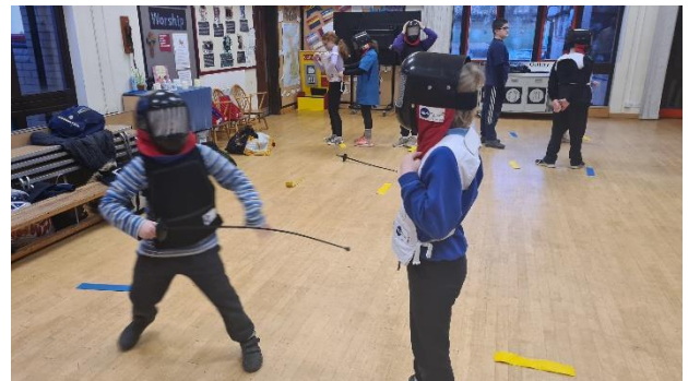
Fencing Club at school.